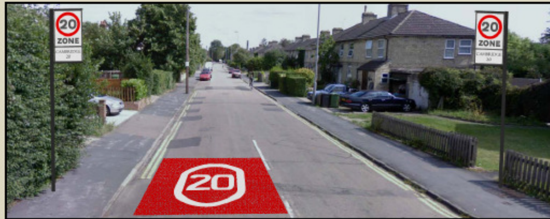
Example of how entry into the proposed 20mph on a main road could look: a 20mph 'roundel' road marking with coloured road surface and two 20mph Zone entry signs.