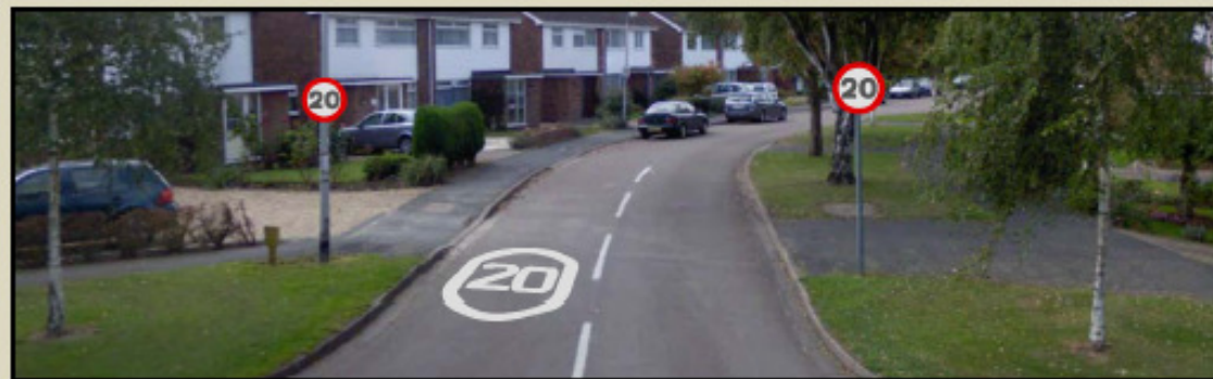
Example of how entry into the proposed limit on a smaller road could look: a 20mph 'roundel' road marking and 20mph limit signs.